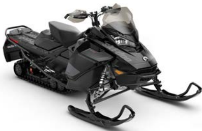
RENEGADE® ADRENALINE 600R E-TEC® shown