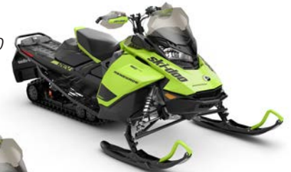
RENEGADE® ADRENALINE 850 E-TEC® shown