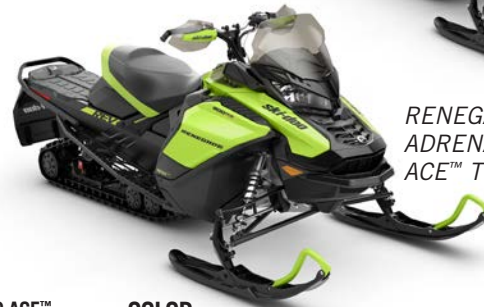
RENEGADE® ADRENALINE 900 ACE™ TURBO shown