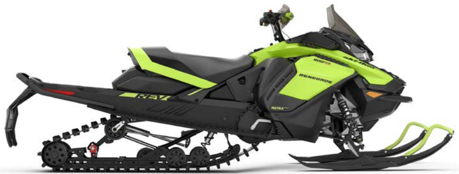
RENEGADE® ADRENALINE 900 ACE™ TURBO shown