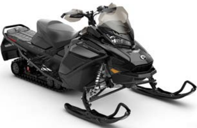
RENEGADE® ADRENALINE 900 ACE™ shown