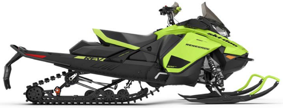
RENEGADE® ADRENALINE 850 E-TEC® shown