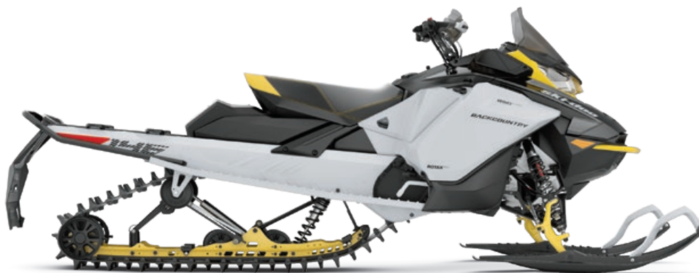
BACKCOUNTRY 146 850 E-TEC SHOWN