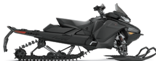
BACKCOUNTRY 600R E-TEC SHOWN

Loaded with crossover-specific features for spending equal time riding on- or off-trail.