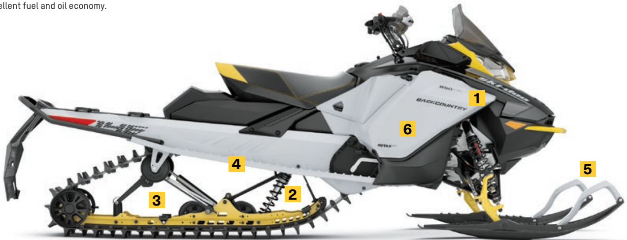
BACKCOUNTRY 146 850 E-TEC SHOWN

Crossover-specific suspension uses best principles of the rMotion™ trail and tMotion™ mountain skids for confident cornering and agile boondocking.