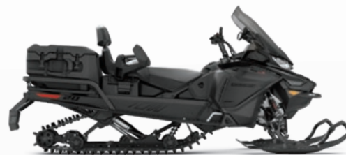
EXPEDITION SE 900 ACE TURBO SHOWN

The utmost touring sport-utility vehicle with an incredible list of work and luxury features.