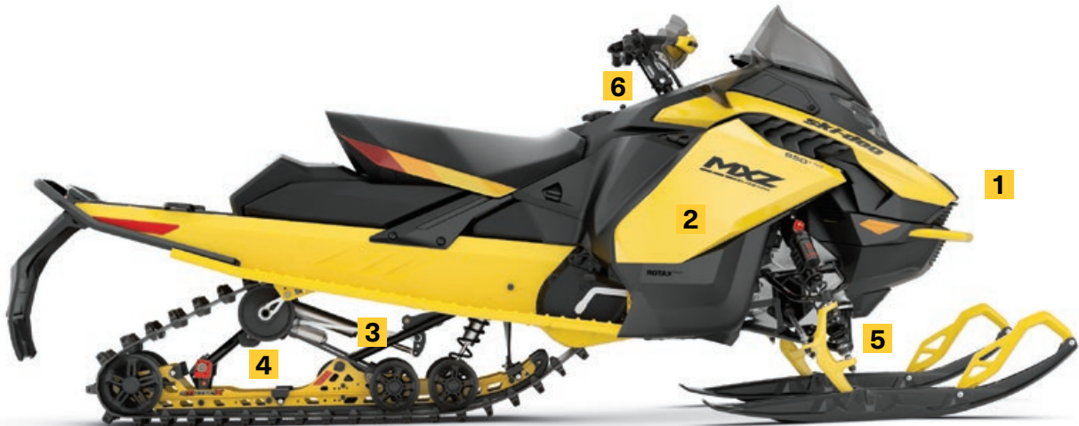
MXZ BLIZZARD 850 E-TEC SHOWN

KYB Pro 36 Easy-Adjust front and rear shocks featuring compression adjustment. HPG Plus center shock. All four shocks are aluminum and rebuildable/revalvable.