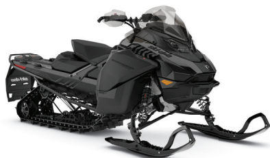
BACKCOUNTRY ADRENALINE 600R E-TEC SHOWN

Loaded with crossover-specific features for spending equal time riding on- or off-trail.