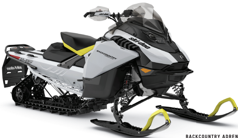
BACKCOUNTRY ADRENALINE 146 850 E-TEC SHOWN