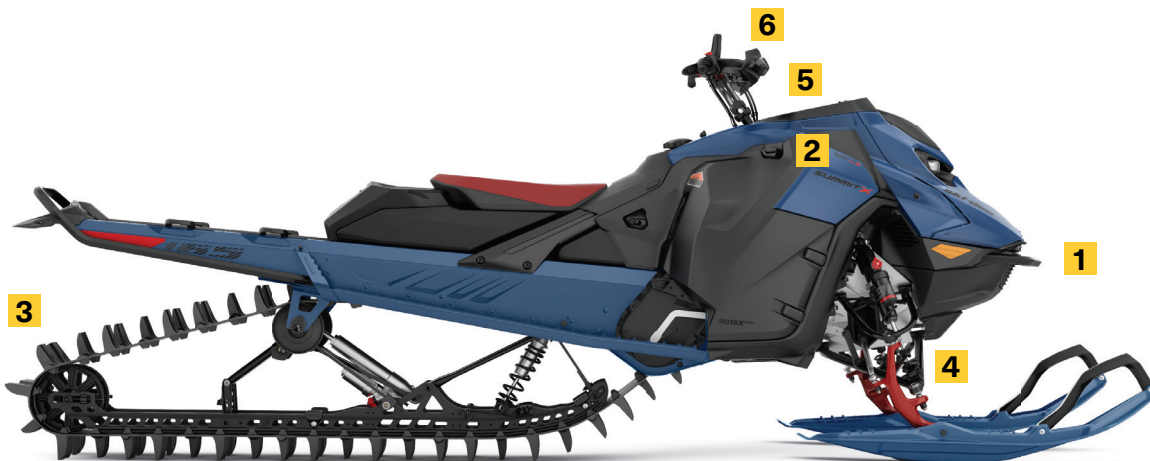
SUMMIT X WITH EXPERT PACKAGE 165 850 E-TEC TURBO R SHOWN

This lighter, redesigned 16-in. track unique to the Expert package, has a stiffer edge that compliments the fixed rear arm of the tMotion XT for more rigidity in the rear skid.