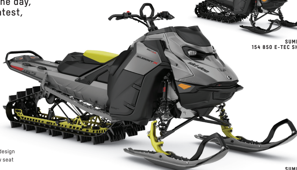
SUMMIT X 165 850 E-TEC TURBO R SHOWN